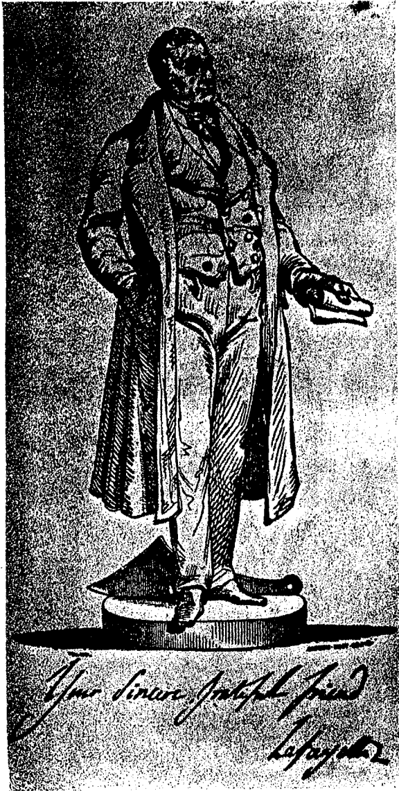
Statue of Lafayette